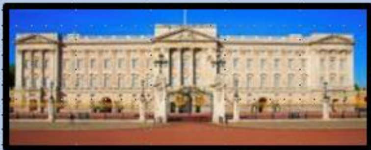
The Queen's home in London is Buckingham Palace.