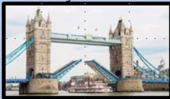
Tower Bridge can open so that tall ships can travel underneath it.