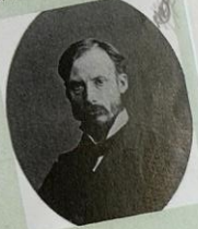
Pierre - Auguste Renoir

Born: 1841 Died: 1919, aged 78 From: France Lived: France