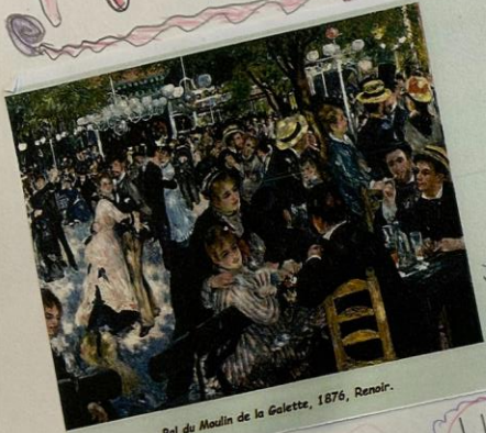
Bal du Moulin de la Galette, 1876, Renoir.

Born: 1841 Died: 1919, aged 78 From: France Lived: France