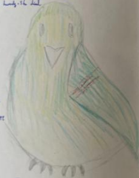
This is the parrot from her painting. She was inspired by the parrot.