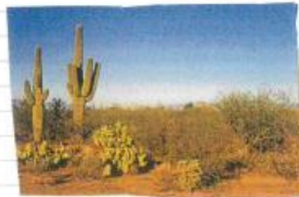
In this picture I can see with no other animals.