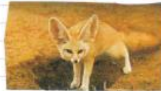
This is a fox not just any fox it's a fennec fox that can survive the desert.