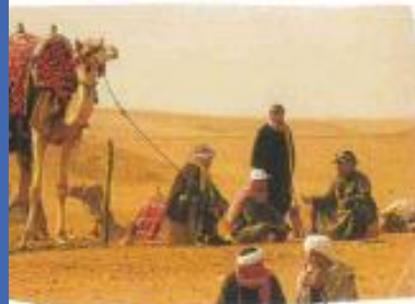
we over there maintain that much water.

Hello, I'm here to tell you about a desert and there biome a biome has there own animals, plants, temperatures and climates and our biome is a desert. In a desert there is not water. Deserts cover \frac{1}{3} of the Earth's population and in a desert it's really hard to survive. Not only that it's hot. Deserts there are hot deserts there are cold deserts, but only it's hot during the day it's also hot during the nights and hot deserts are found in hot places some examples Africa, India and Australia. Deserts common condition animals of heat.