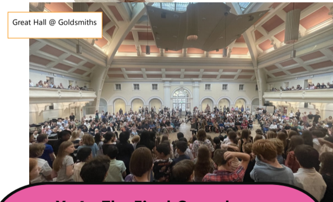
Great Hall @ Goldsmiths