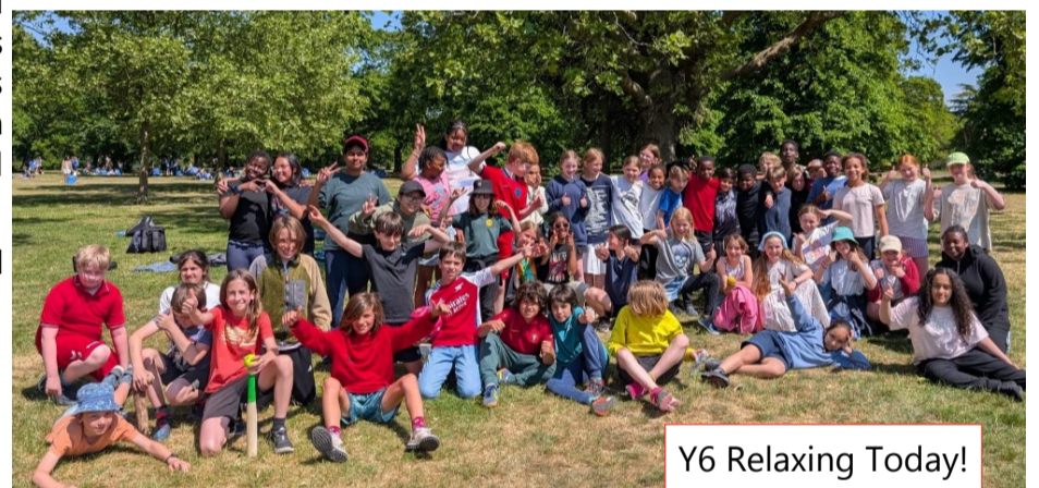
Y6 Relaxing Today!

Click on the banner here to be taken to the Eventbrite ticket page. We look forward to seeing as many of you there as possible