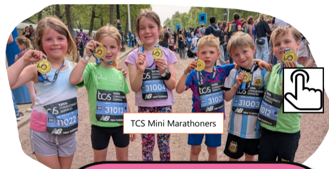
TCS Mini Marathoners