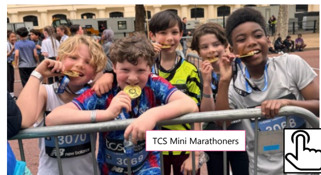
TCS Mini Marathoners