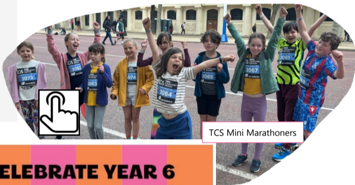
TCS Mini Marathoners

Thanks to all the people involved in making these events happen!