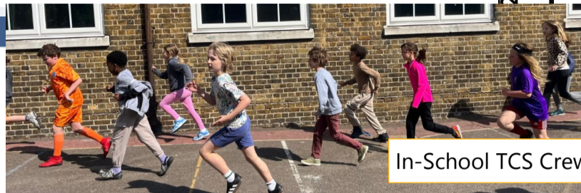
In-School TCS Crew