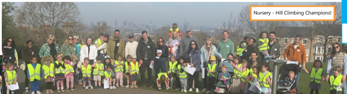
Nursery - Hill Climbing Champions!