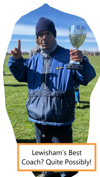
Lewisham's Best Coach? Quite Possibly!

More thanks - this time to you, the community! The combination of ParentPay donations, red nose sales and on the gate collections means that Edmund Waller contributed a whopping £774.72 to this year's Comic Relief campaign.