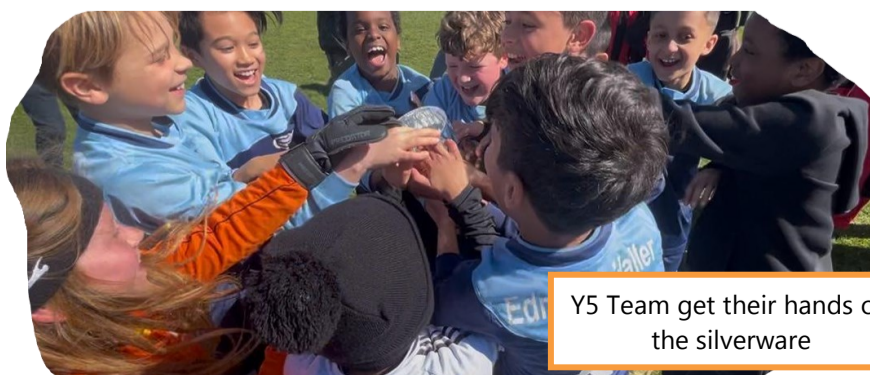
Y5 Team get their hands on the silverware