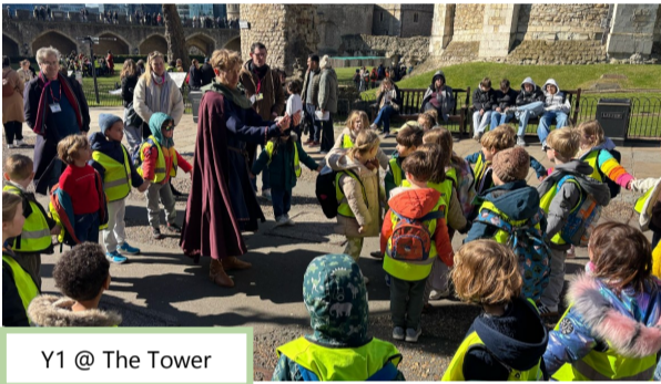
Y1 @ The Tower