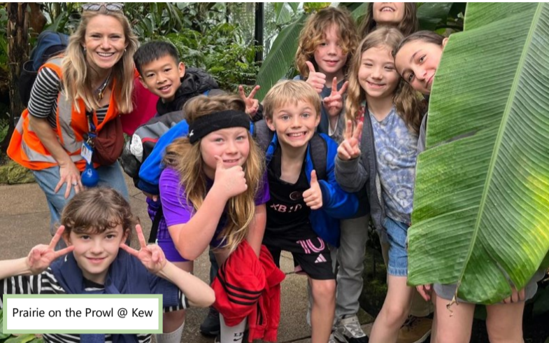
Prairie on the Prowl @ Kew

We have a couple of places left to take part in the Big Half. This year this Big Half takes place on Sunday 7th September. Use this link to register your interest for a place in this year's race - you can get fit and raise money for the school too