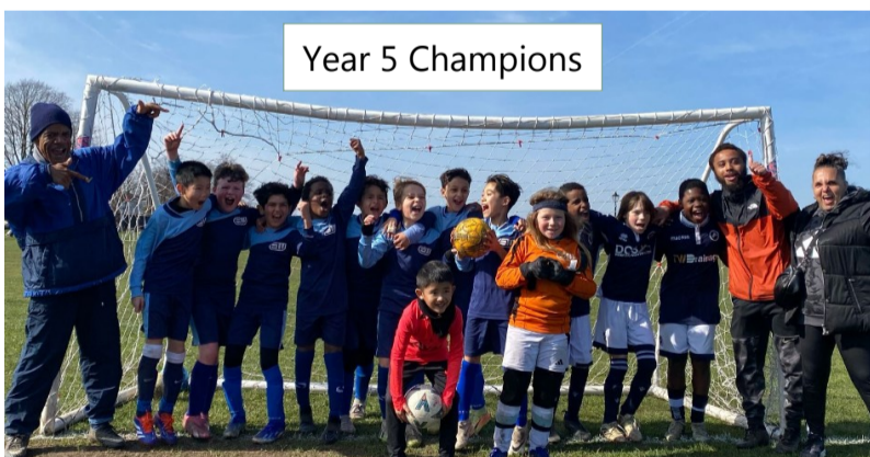
Year 5 Champions