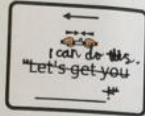
shouted "I can do this. Let's get you"

2. Improve this sentence by adding the 'what'