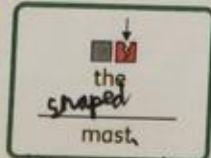
the snapped mast,