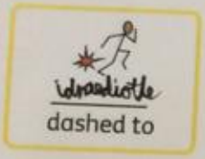
Lucy dashed to