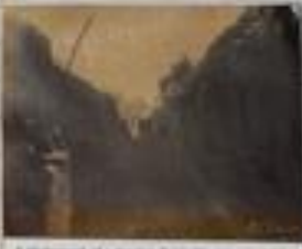
A photograph of a street in Benin (taken in 1897)

This is a secondary source because the people that created it weren't actually there and they don't have proper gear.