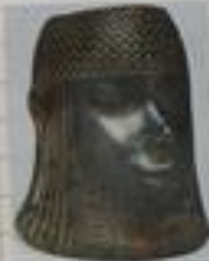
A Benin bronze head of an Oba

This is a primary source because it was made at the time as the kingdom was still around.