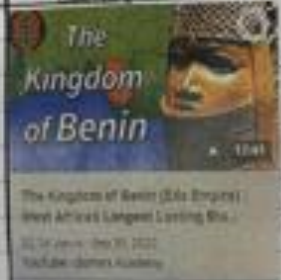
YouTube documentary about Benin

This is a secondary source because the people that created it weren't actually there and they don't have proper gear.