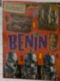
A non-fiction book to teach children about Benin

This is a primary source because it was taken in the streets of Benin.