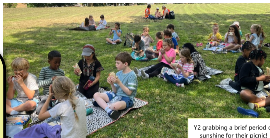
Y2 grabbing a brief period of sunshine for their picnic!

In, what will hope, will be a dazzling display of both ambition and creativity - we look forward to welcoming you all to this afternoon's Take One Picture exhibition. Its looking amazing and we can't wait for you to see the work. We have work from every Year group from Nursery - Y6. We are open from 3:45 - 5:30pm. Have a quick look here to remind yourselves of the order we are hoping you will go around the exhibition in. There will be also be a PTA run bar and a performance from the Y2/Y3 choir - what a lovely way to end the week!