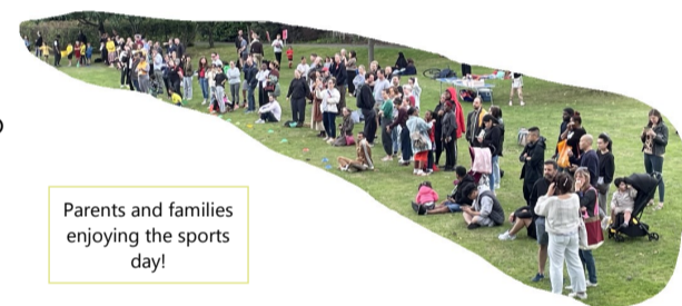
Parents and families enjoying the sports day!