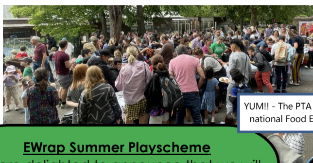
YUM!! - The PTA International Food Event