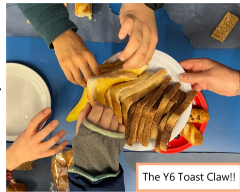
The Y6 Toast Claw!!