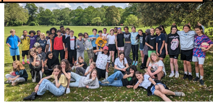
Some well earned post SATS relaxation