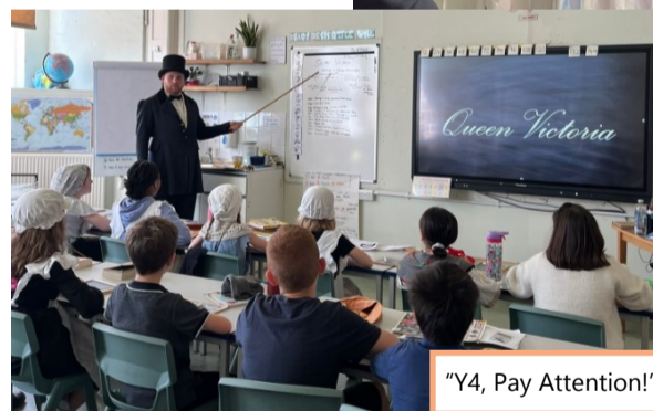
"Y4, Pay Attention!"

In other year group news, today, Year 4 have been whisked back in time to the Victorian era, with a full day's workshop. Some of them have been quite startled by the Victorian teacher's ever so slightly less 'child centred' approach to education!! Hopefully they will learn loads and come to appreciate their class teachers' dedication and support, that little bit more!