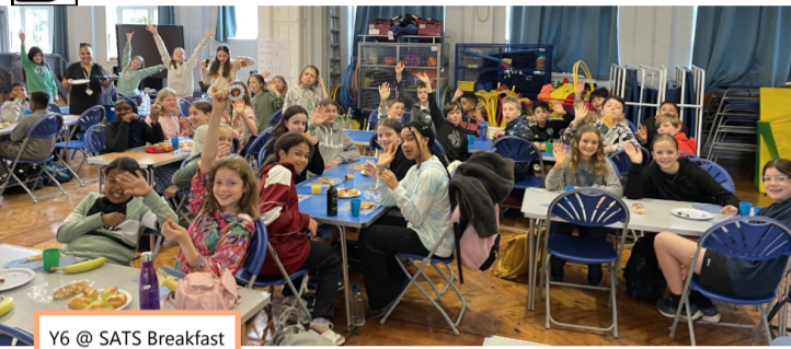
Y6 @ SATS Breakfast