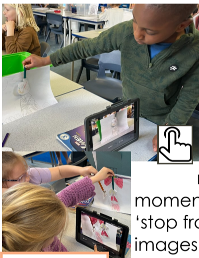
Stop, Frame, Action! - click on each image for a peek @ Y2's work