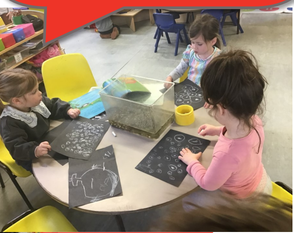
Nursery observing the changes in frogspawn

Science Posters Don't forget to get your posters designed and handed in by 21st March, when we will shprtlist our top 5 faves and submit them to the national competition.