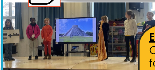
Year 4 Assembly - Well Done!