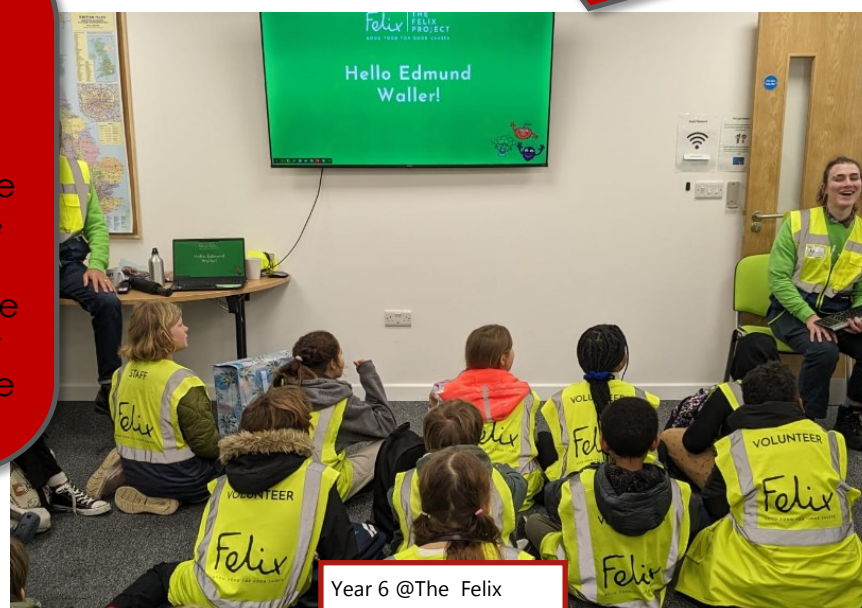
Year 6 @The Felix Project.