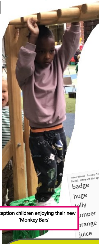
Reception children enjoying their new 'Monkey Bars'