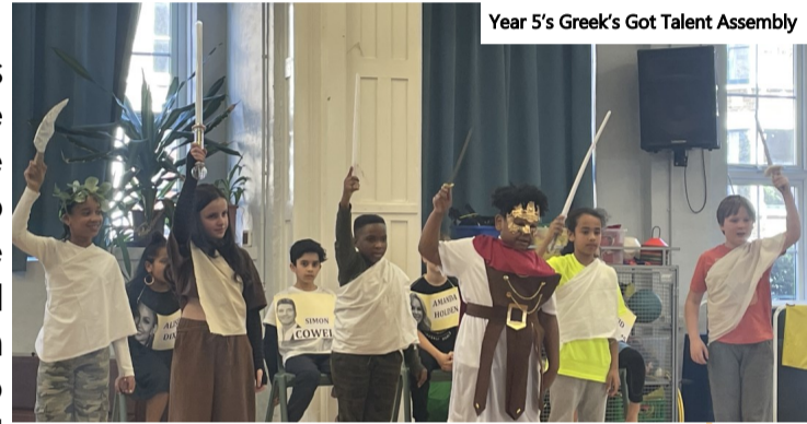
Year 5's Greek's Got Talent Assembly