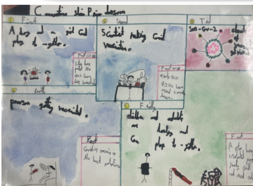
Year 2 WINNER!