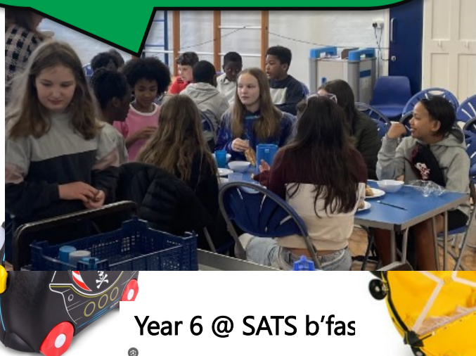
Year 6 @ SATS b'fas