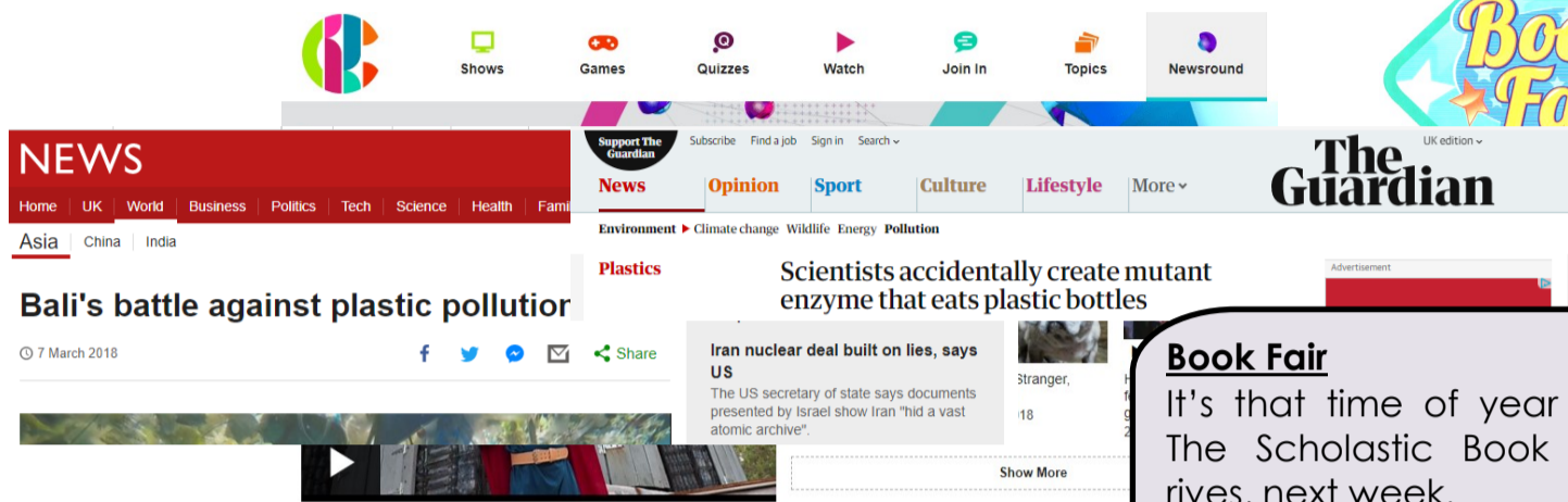
The castle made out of plastic

This term, we are continuing to look at the problem of plastic pollution. This theme has struck a chord with the whole school population. In Monday assemblies, we have looked at the problem of pollution around the islands of Bali, which used a very sobering video. More hopeful, however, were the actions being taken to counter the problem; with the discovery of a plastic eating enzyme and the story of a man who has built a castle from plastic bottles!! Below are the links to the videos shown, should you want to continue the discussion at home: